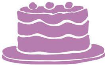
7 INCH = 175MM 10 to 12 serves