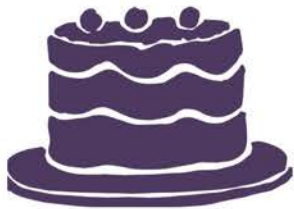
5 INCH = 125MM 6 to 8 serves